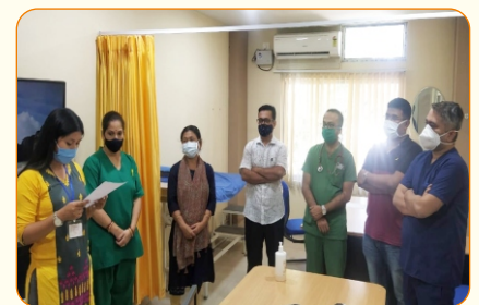
Pledge taking by Private OPD Staff