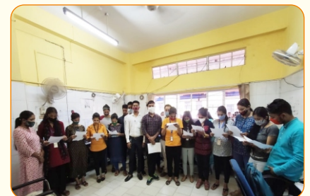
Staff of AAA and PMJAY taking pledge