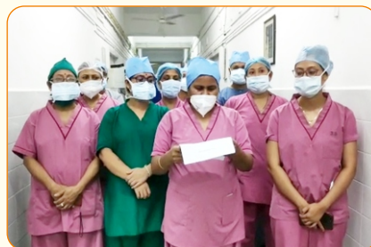
OT Sisters taking integrity pledge