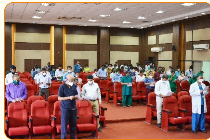
A view of pledge taking by BBCI employees and students