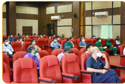
Observation of Vigilance Awareness Week at BBCI Auditorium