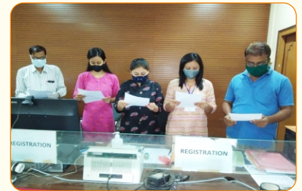
Pledge taking by Registration Staff